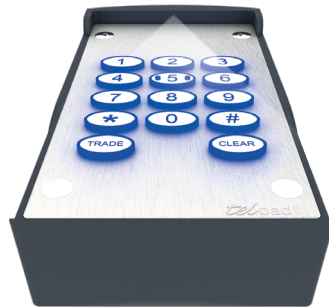
Dimensions: H 166 x W 89 x D 40 (mm)